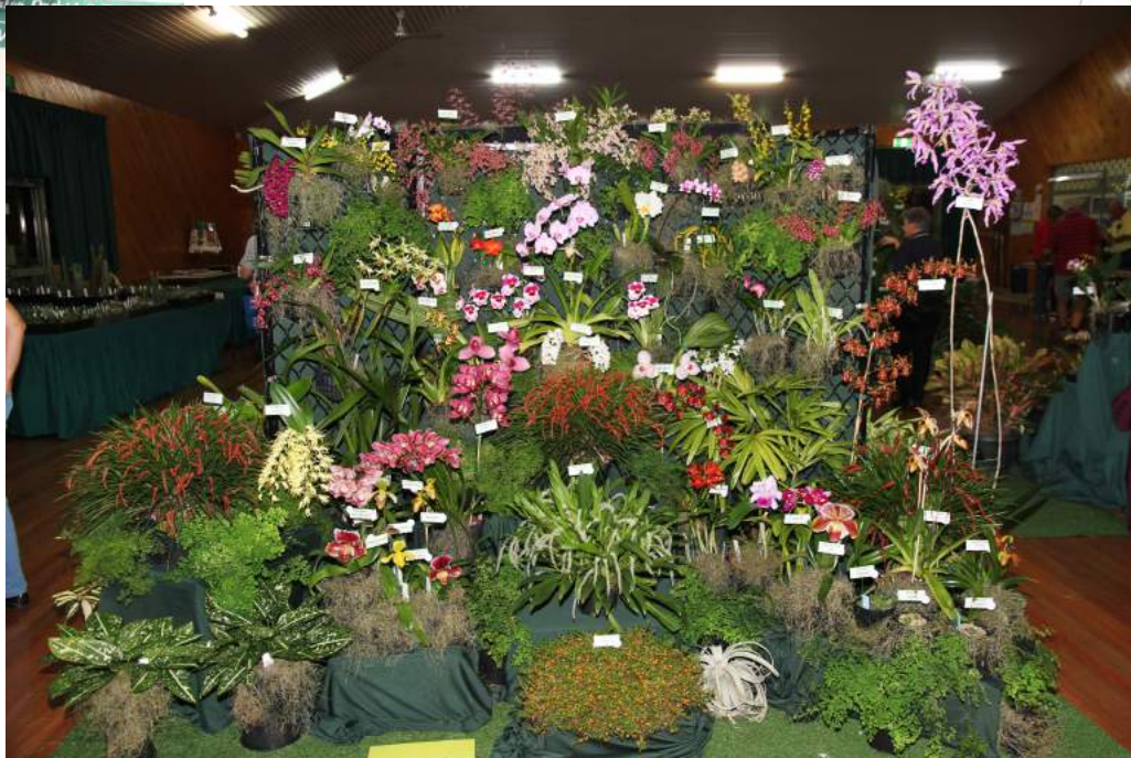
Our Display at Caboolture