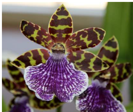
Z. Kiwi Choice 'Impressive x Zga.Zest 'Toni' M & A Vleckkert