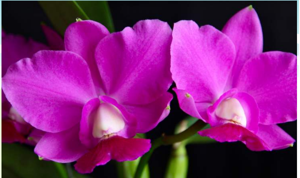
Aloha Case 'Hawaiian Style' – Tom Buckley