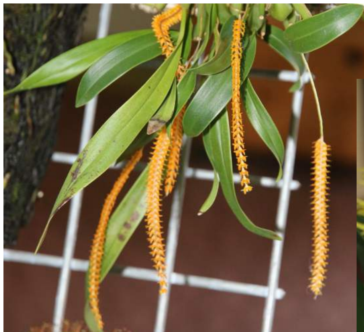
Dendrochilum pulcherrimum