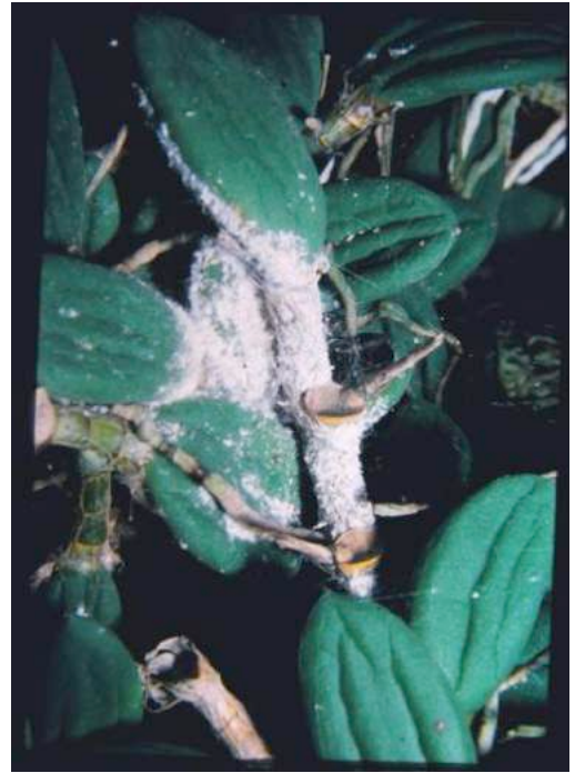
Fig. 122: Boisduval Scale