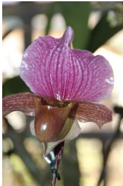
Paph. Charlesworthii