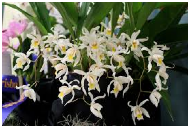
Coelogyne Unchained Melody

Our warmer conditions on the Sunshine Coast would enable most if not all of these species and hybrids to be grown without special care. Ones in this article which should be grown cool to intermediate (C-I) are cristata and mooreana . The remainder mentioned is either intermediate (I) or intermediate to warm growers (I-H). In Botanica's Pocket Orchids , Lavarack and Harris, it sets out the guidelines based on the average minimum night temperatures the species will tolerate in cultivation. Some will grow outside the range if care is taken, for example, if the plant is kept away from cold winds. C=Cool=7-10 degrees C; I=Intermediate=10-18 degrees C; H=Hot=18-21 degrees C. Thanks to the Orchid Societies Council of Victoria for this article.