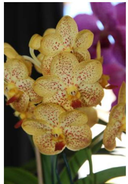
V Salmon Spots – R Aisthorpe