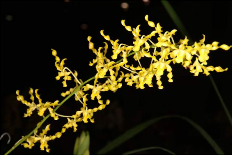
Best Aust Native - Den. Johulatum