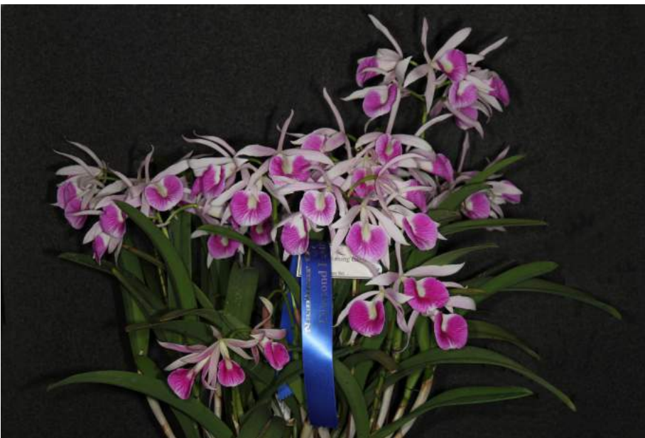
Champion Specimen - Bc. Morning Glory