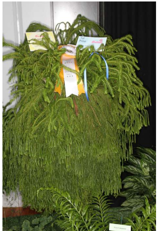
Best Foliage - Rock Tassel