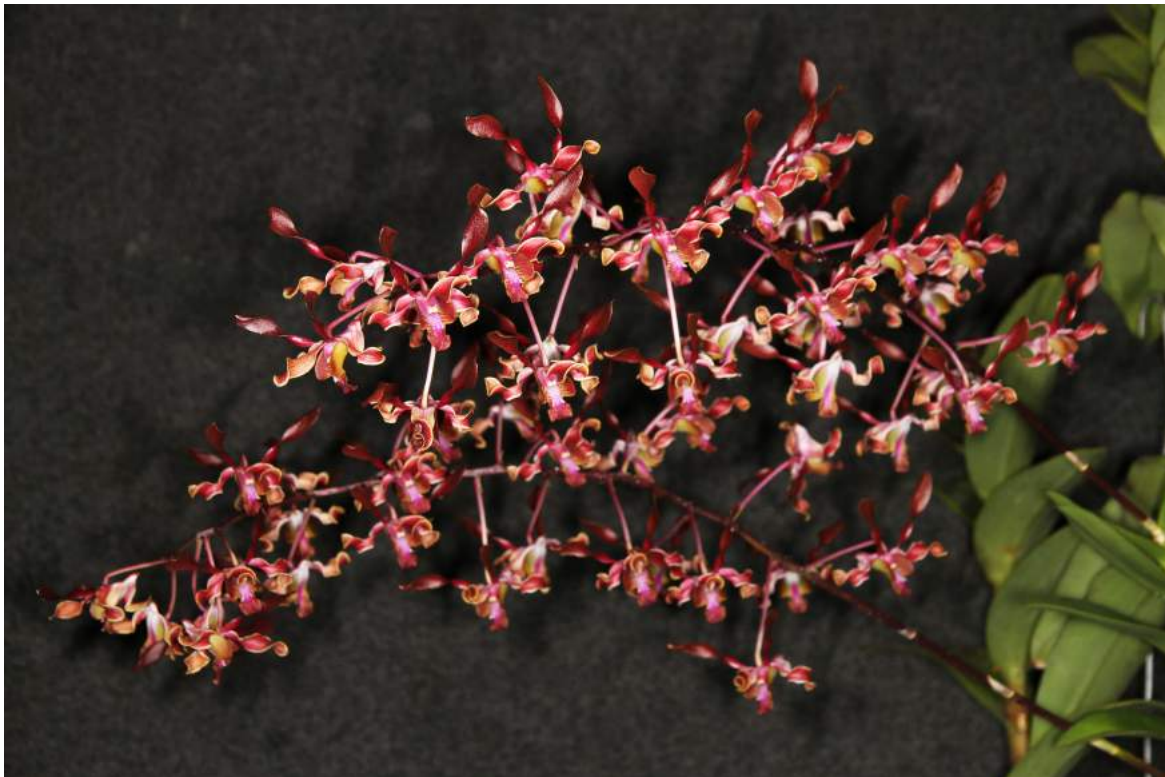
Champion - Den. Cherub x tangerinum

The show was financially successful and the Cittimani Hospice service on the Sunshine Coast will benefit from a distribution.