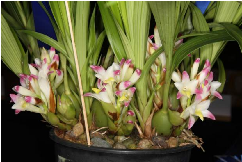
Best Misc - Coelia bella