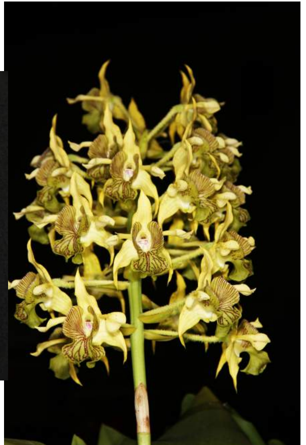
Champion Species - Den. macrophyllum