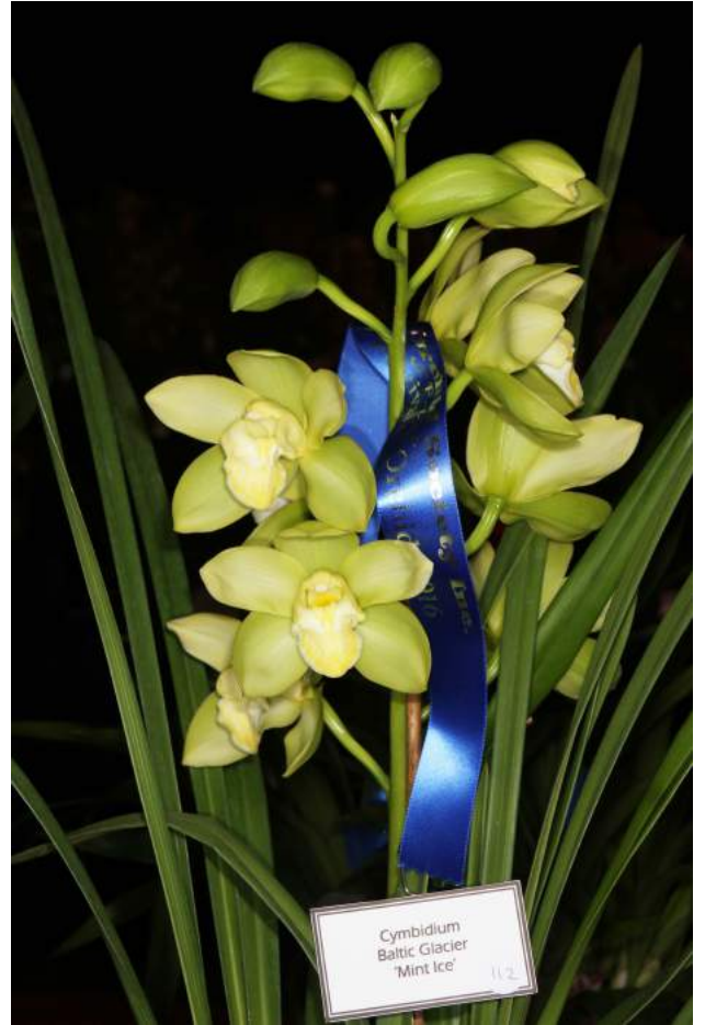
Best Cymbid. Cym. Baltic Glacier