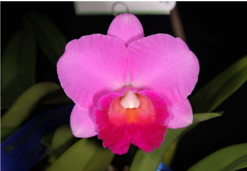
Best Cattleya - C. Dendi's Perfection