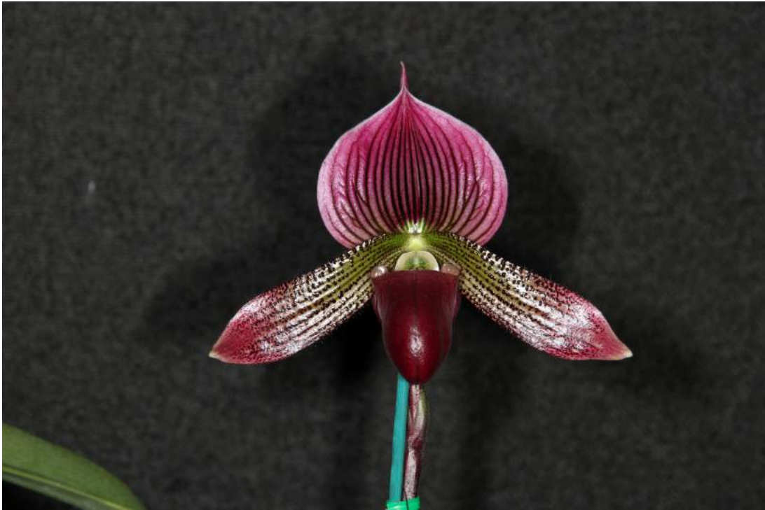
Reserve Champion - Paph. Eerie Flame