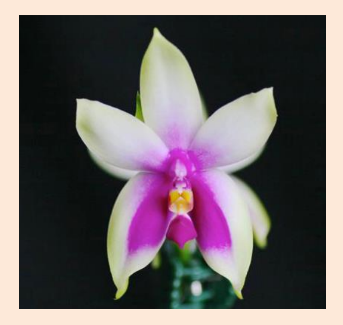
Judges Choice plant of the month for February 2014

Plants are to be tabled by 1.30pm for judging