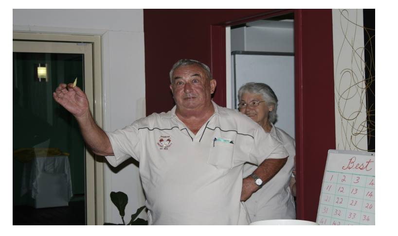
The rolling raffle master at his best