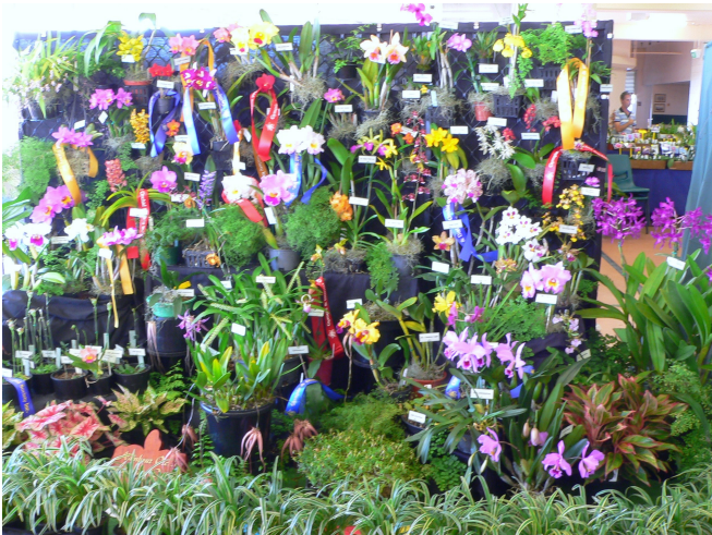
The Society display at the Gympie Orchid Society Show