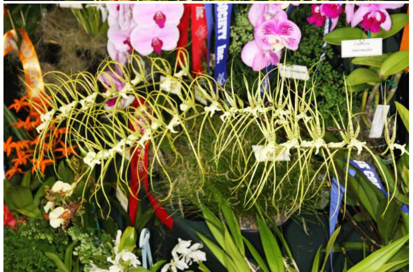
Our display at Glasshouse Show