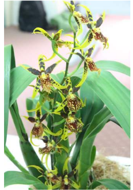
Bracidosteale Gilded Tower 'Mystic Maze' Luda.