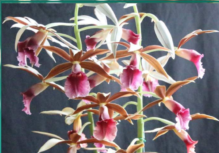
Phaius tankervilleae. - Luda.