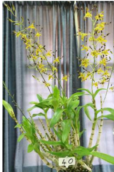
Dendrobium Touch of Gold - Cliff