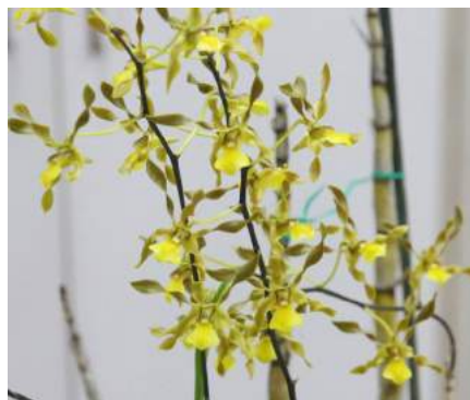
Dendrobium trilamellatum - Cliff