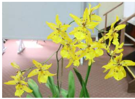
Oncidium Tiger Crow - Mal & Jo