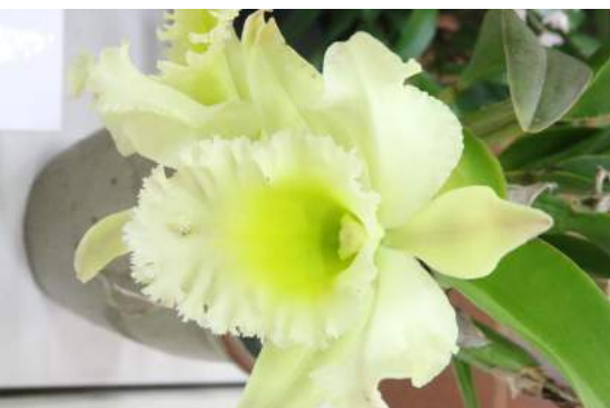
Cattleya unknown - Lyla