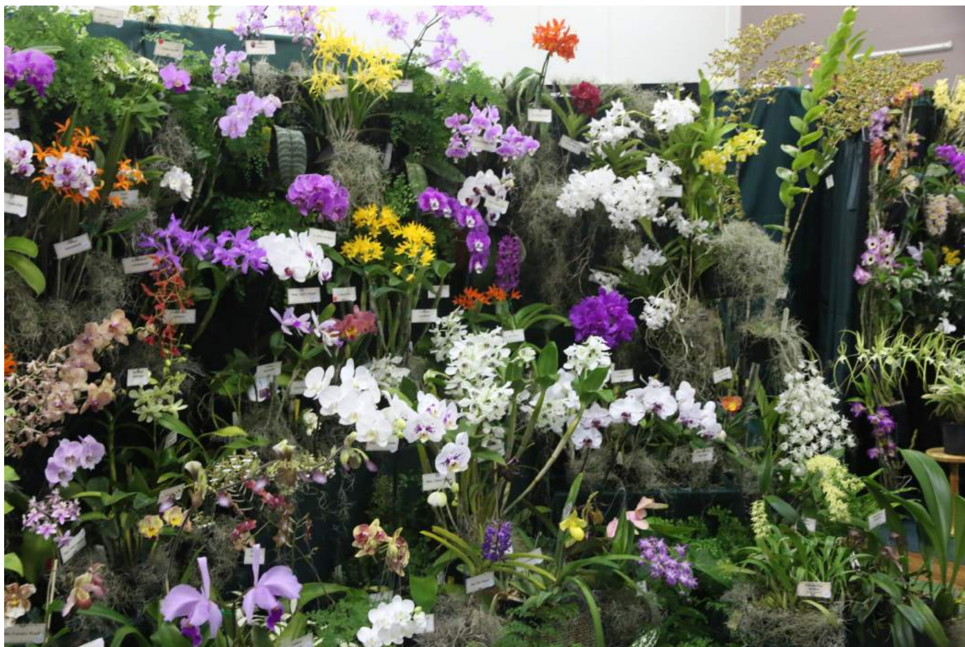
Our display at Glasshouse Orchid Show