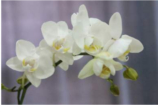
Phalaenopsis unknown - June