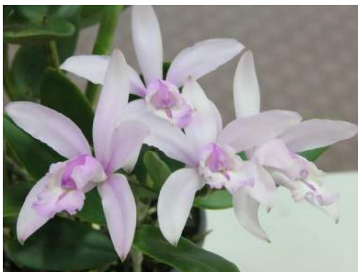
Cattleya intermedia - Cheryl