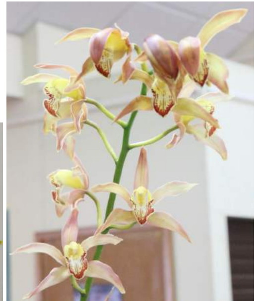
Cymbidium unknown - Lyla