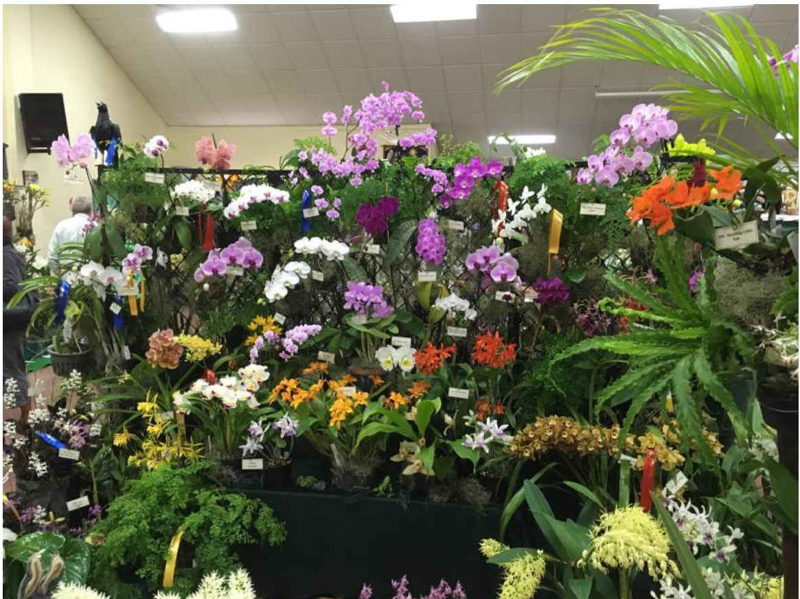
A section of our Spring Show display