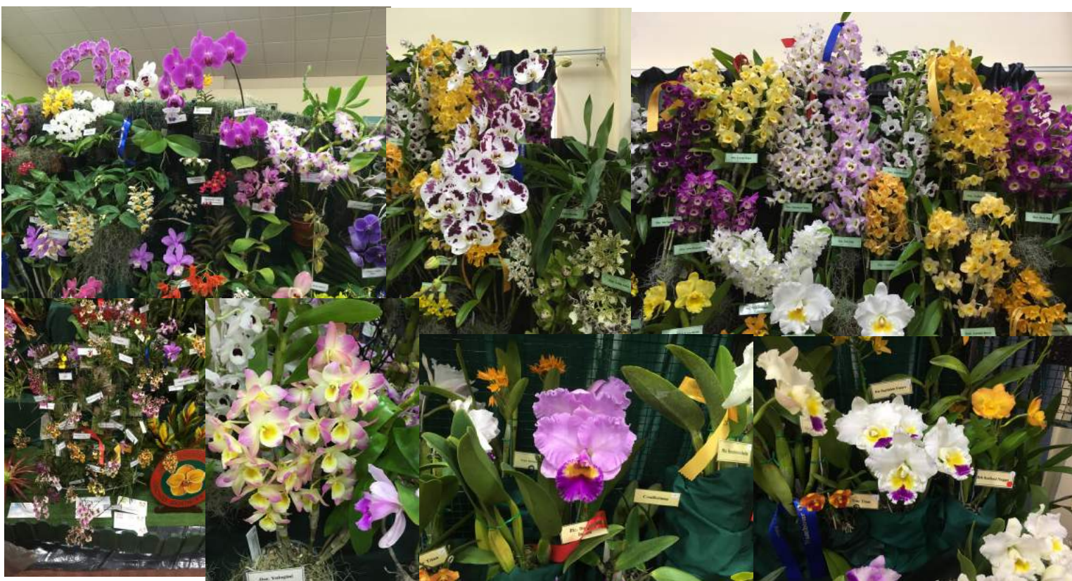
Montage of all displays at the show