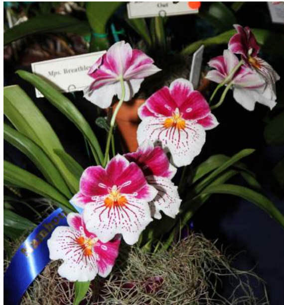
Champion Novice Mps. Breathless - Luda