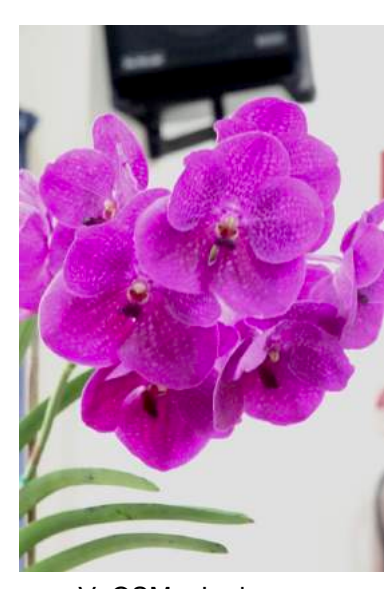
V. OSM - Luda