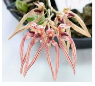
Bulb. Meen Ocean Brocade Duncan