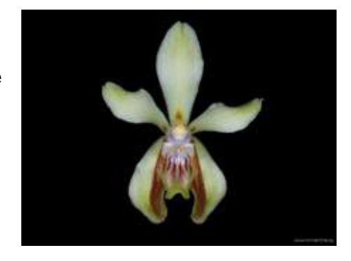
Some hybrids using V.lamellata .

There are two main forms, forma boxallii (left) and forma remediosae (right). There is also an alba form. Boxalli has more reddish purple on the bottom sepals whereas remediosae has more brownish colour on the bottom sepals.