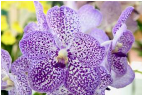
V. Kultana x V. Pakchong Blue Cheryl