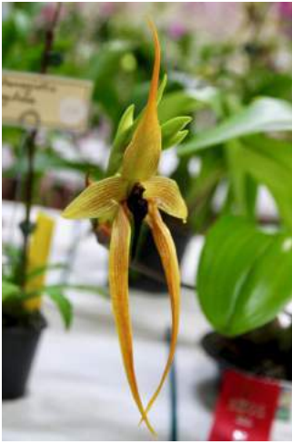
Bulbophyllum Wilbur Chang Bill