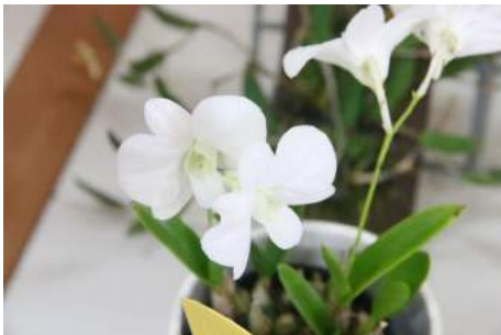
Den. bigibbum var. compactum Alba Nita