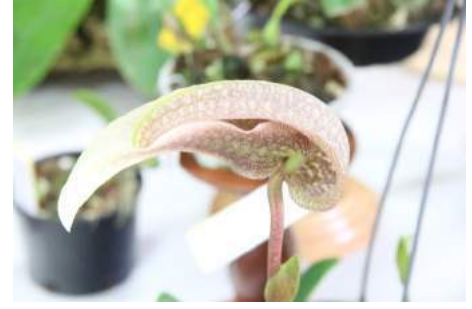
Bulb. grandiflorum - Jenny