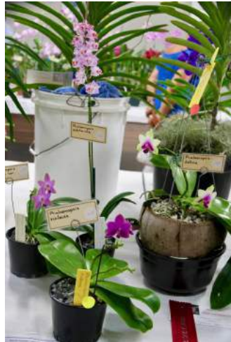
Phalaenopsis group Judy