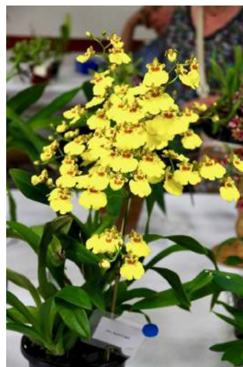
Oncidesa Sweet Sugar Col.