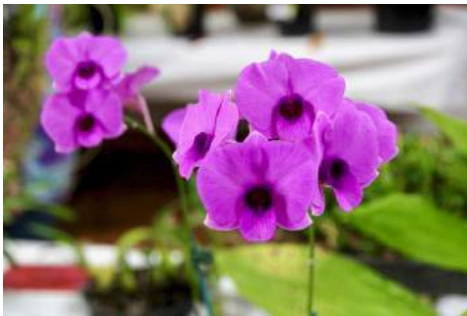
Den. bigibbum Judy