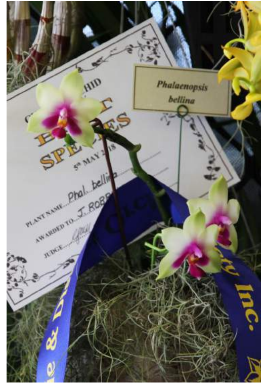
Champion species - Phal. bellina Judy