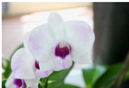
Den. Chao Praya Sweet x Den. Hidden Money Luda