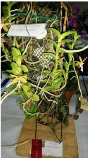
Trichoglottis philippinensis Duncan