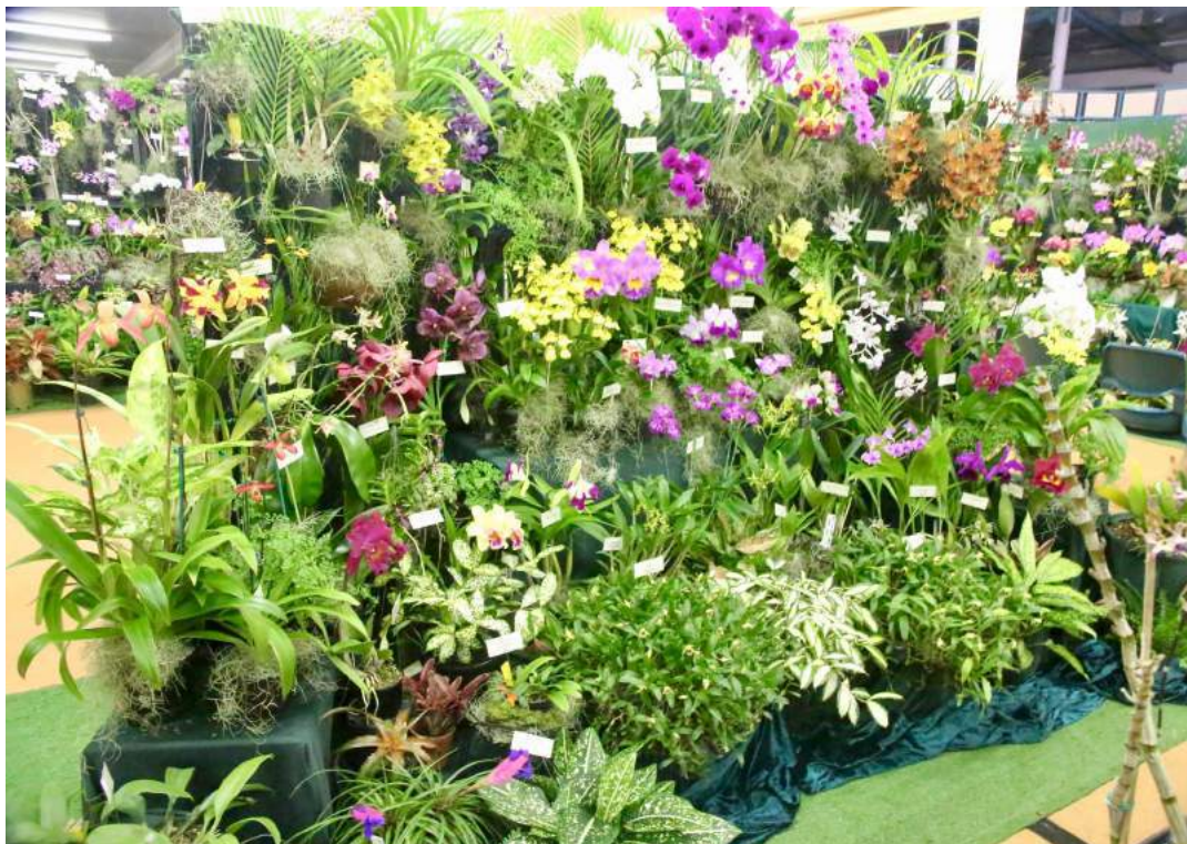
Our display at Gympie Show