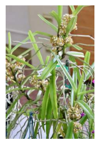
Acampe papillosa