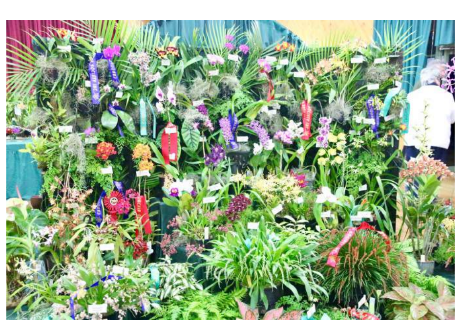
Our display at Caboulture