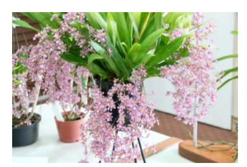
Onc. sotoanum - Grahem & Beryl