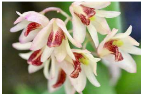
Den. rigidum - Duncan