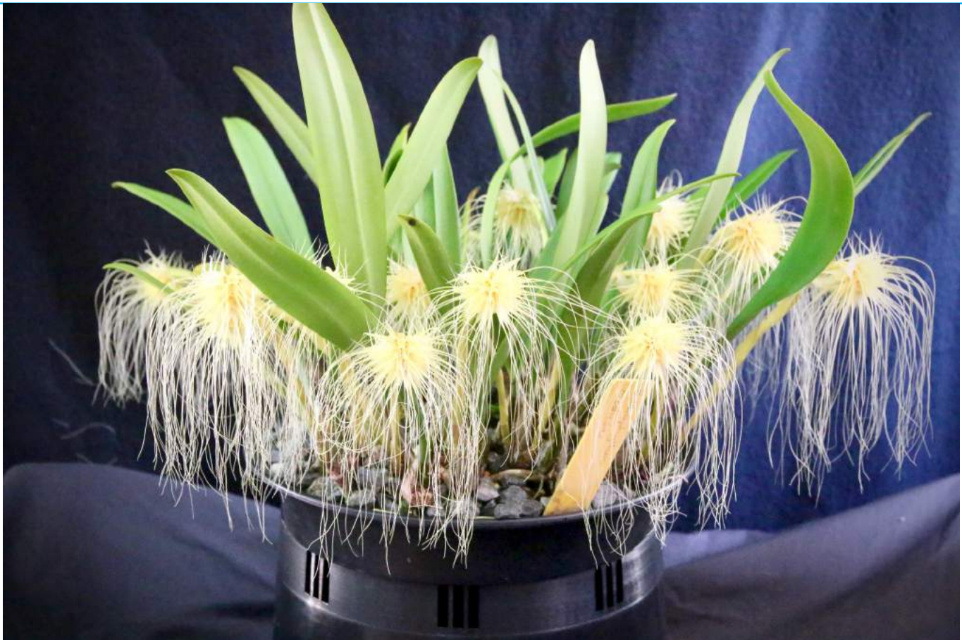
Judges Choice - 2018 - Bulbophyllum medusae . grower - Judy