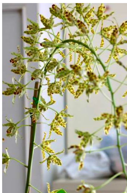
Gram. scriptum - Rod & Jan