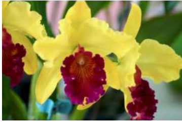
Rlc. Arom Gold