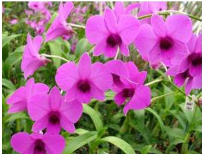
Dendrobium bigibbum var. compactum

In summer we need high temperatures to get good, strong growth. With light watering once weekly commencing in late October till late November-early December. Then water heavily daily till Mid-March then reduce to every 3rd day from mid-March till late April. Then watering ceases until mid-October with light watering commencing again. Fertilising (mixed at \frac{1}{4} recommended strength) commences around early December, applied daily with watering, ceasing in mid-March. The fertilising regime should alternate between a high Nitrogen (I use Calcium Nitrate) and a high Potassium blend. This will provide lush growth with strong flowering potential in the autumn. It is important to keep in mind that in late October in South-East Queensland minimum temperatures are still only 16-17 degrees C (check the corresponding temperatures in the tables above in October-Weipa: 21.8 degrees C). So don't be too keen to give them that "Tropical deluge" via the hose just yet.