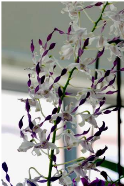
Den. Purple Spiral x gouldii - Cliff