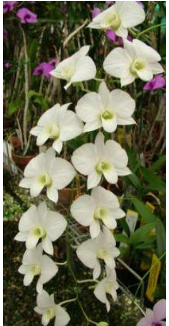
Dendrobium bigibbum var. superbum forma alba

They must be completely dry again by sunset!!! This cannot be over-stressed and will stave off too much pseudobulb shrivelling and minimise leaf drop. Keep in mind between May and the end of October the median rainfall is 18mm (Weipa) with each rain day only dropping 0.2-0.5mm. This would barely wet the leaves and barely touch the roots and average daily temperatures are still @ 32 degrees C. Although the other statistics show more rainfall at this time of year the trade winds are strong and very drying in these locations over the drier months and so create what most of us would consider terrible conditions for orchid growing, yet this is their natural environment. As stated earlier these are really tough plants .