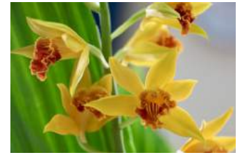
Phaius Maculato Grandifolius - Luda