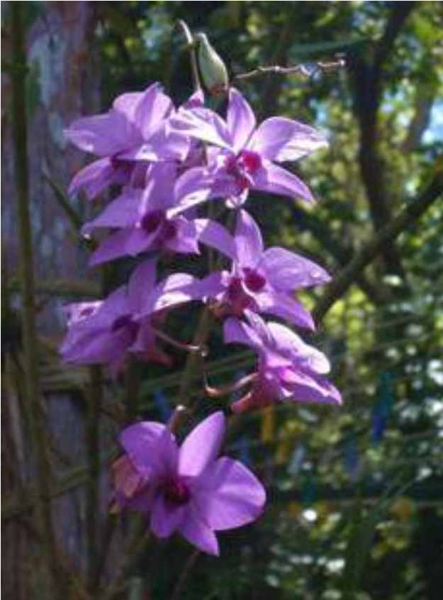
Dendrobium bigibbum var. bigibbum

John Green highly recommends keeping the pots as small as possible when repotting Dendrobium bigibbum allowing as many roots to grow outside the pot as possible as they need plenty of air around the roots for