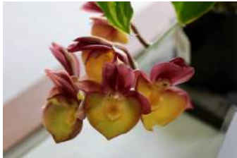
Ctsm. Orchidaglade 'Bab'