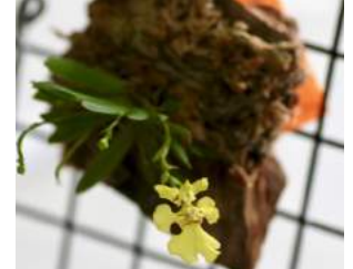
Erycina pusilla - Gabrielle