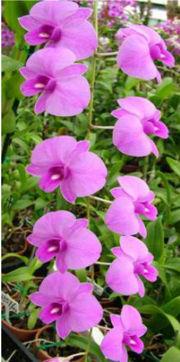
Dendrobium bigibbum var. superbum

Over winter Dendrobium bigibbum can cope well with cold nights so long as the days are warm, and the roots are DRY . A covered greenhouse provides ideal conditions and also keeps rain off the plants when you don't need it in winter. Position the plants at the highest place in the greenhouse. Dry conditions are essential with only occasional misting and then only once every 3 weeks or so and only on above average day time temperatures.