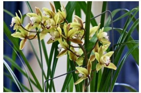
Cym. King Arthur 'Ulfius' Roger