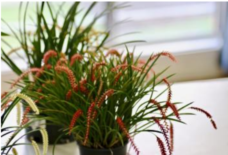
D wenzelii Pat