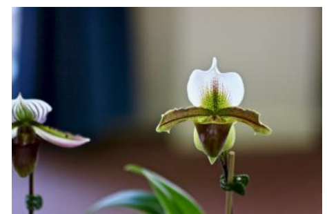
Paph. unknown Jenny