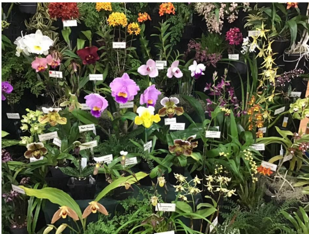
Our Display at the Caboolture Show

As usual, a final word courtesy of Roger Rankin – It's nice to go into the flowering house and do nothing.....bet you can't do it". Gina