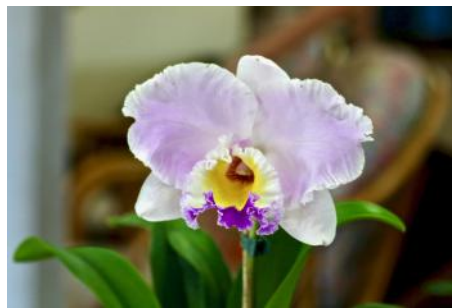
Rlc. Bundy's Ranger 'Kislsey' Tom